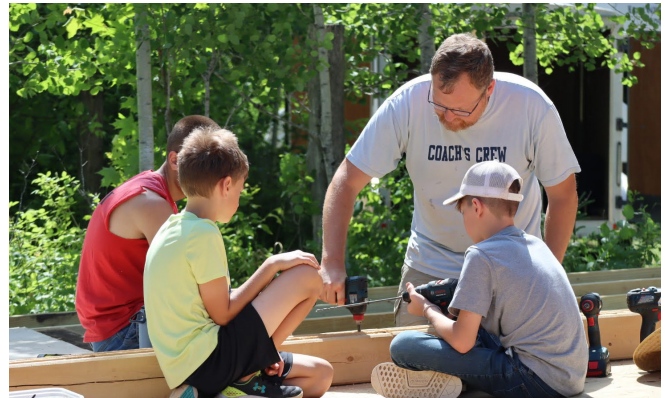
Mission to Michigan 2025

Fortunately, at least for now, we have the opportunity to “Work willingly at whatever [we] do, as though [we] were working for the Lord rather than for people.”