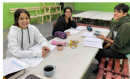
Discipleship Training in Costa Rica