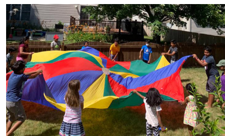
CEF Five Day club hosted by the Kudari family