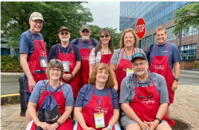
2022 Spread Truth team from East White Oak

The trip might be described as a one-week evangelism boot camp. We spent each day on the streets of New York City either offering to pray with people in the various boroughs or engaging with people in the parks, all with the idea of sharing the good news of Christ.