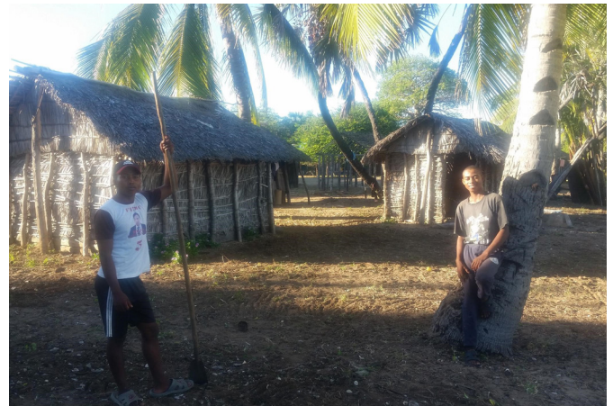
Malagasy villagers on the island of Nosy Mitsio Madagascar

Finally, when it comes to evangelism, we need to remember who develops and grows the Harvest. God is the Lord of the Harvest and the one whose very words caused all of creation to come into being. In that, the pressure is off of us to produce results. I love Matthew 13:24 where Jesus