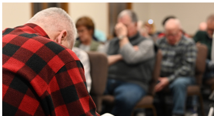
Prayer meeting at East White Oak

There is a connection between unified prayer and powerful evangelism. In John 17 the Lord prayed that his church would be “one” (i.e. unified). The early church experienced a powerful unity in the early chapters of Acts in answer to the prayer of Jesus in John 17. As they experienced unity they prayed together for the outpouring of the Holy Spirit and boldness in evangelism (Acts 1:14, 4:23-31). And there resulted a GREAT QUANTITY of conversions, which occurred with GREAT FREQUENCY (Acts 2:41, 47).