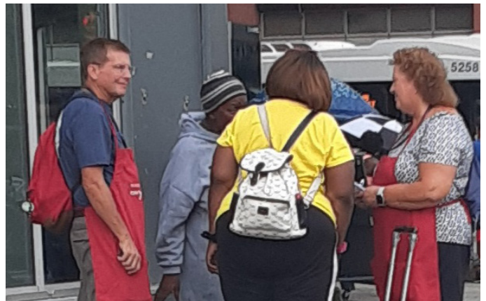
Sharing and praying on the streets of New York City