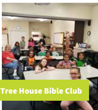
Tree House Bible Club

At the end of the Bible we read about another garden. A place where God and man dwell with one another in peace. A place that brings restoration and healing to God’s creation. We are not there yet. But we like to think that our small piece of land will be a place of healing, restoration, and renewal. A peach tree will be planted, tomatoes will be harvested, and new relationships will be forged. Relationships that will bring the created back to their creator.